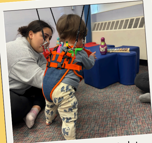
Partial bodyweight support system